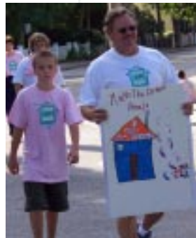
2005 September 25, 2005. Three locations - Hyannis, Falmouth, Orleans. The walk was a march. Slogans such as "Housing is a family value," "Stop the exodus," "Speak out for housing," and "Make the dream real" were adopted. Raised nearly $150,000.

DON'T BE SILENT! Speak out for housing by joining us on September 17!