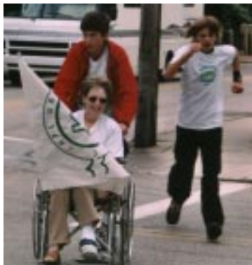
2004 September 19, 2004. Adopted new logo. Added a Walk in Provincetown. Raised $149,780.